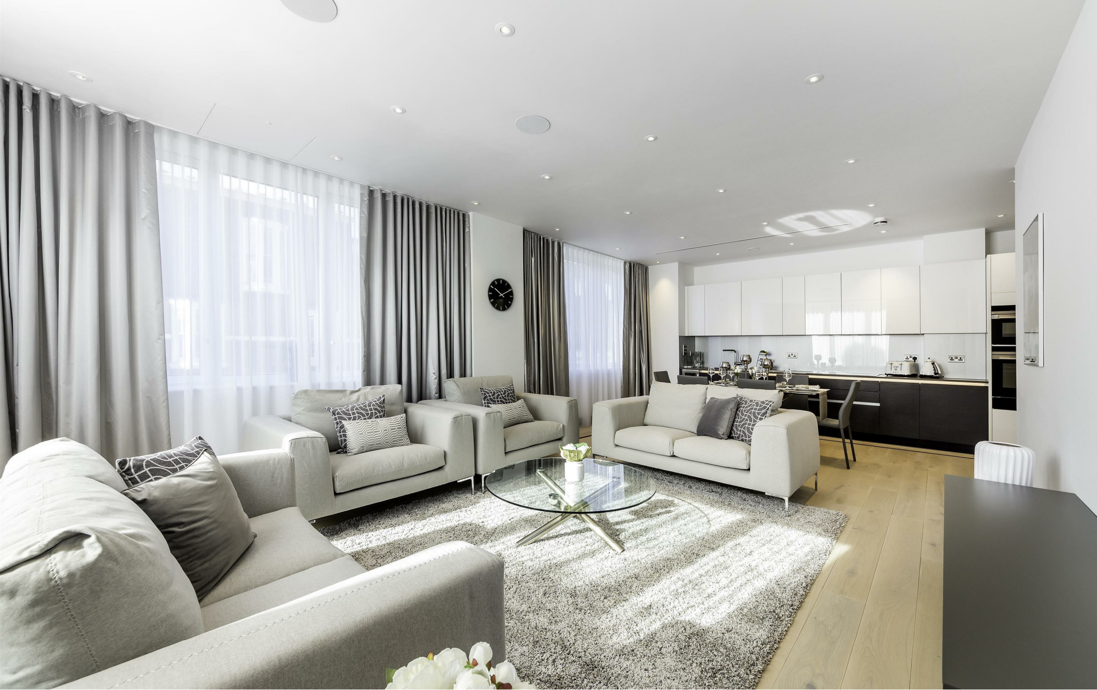
Flat 16 26 Chapter Street London, SW1P 4NP £1,550 Per Week